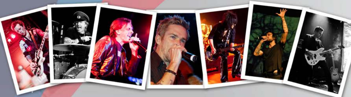
Billy Morrison Billy Idol The Cult